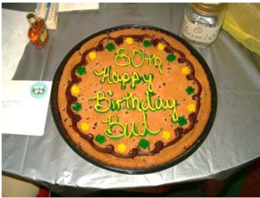
Bud's giant 80th birthday cookie