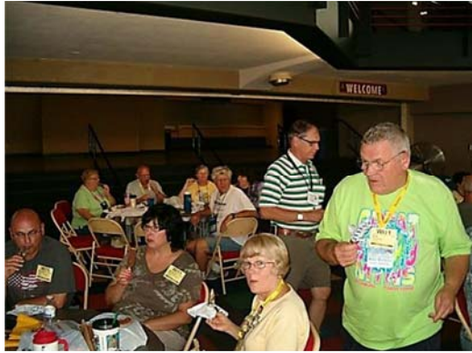
Madison Pre-Rally – Enjoying Ice cream bars after Bar-B-Q’d Brats