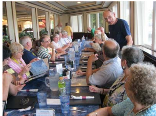
Everyone had a great time at dinner out during the rally - even got four new members during the rally.