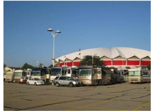
Boulder-Roos parking area for Madison FMCA Rally and the pre-rally.....a stone's throw from our meeting room and night time entertainment.